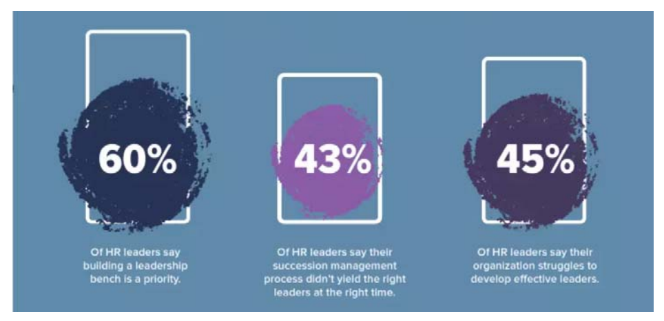
Figure 2. The Leadership Gap

Leaders use organizational leadership to help the organization grow in the desired direction. They lead the path to success in the long run. The advances in international method of leading people by understanding their psychology have resulted in the change of the traditional methods of leading people, especially for human resource management. The HRA method is being studied further to account for different human resource metrics as shown in Figure 2. The view of human resource management has changed completely over the period of time and now human resource is considered as an asset for the growth of the companies in the long run. The system approach has been used here to study the gaps in the leadership.