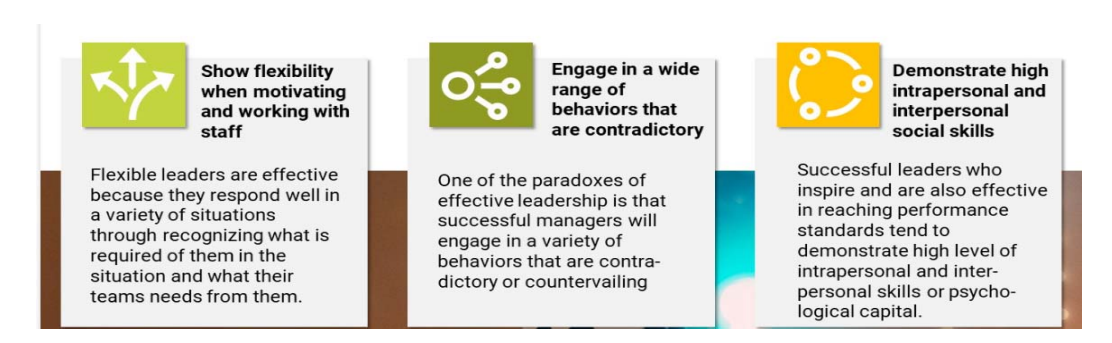
Figure 3. How to improve leadership performance and effectiveness

International companies have taken this human resource management and its implications very seriously and are studying different models to accommodate the HRA and work towards making their valuation model more accurate as shown in Figure 3. In order to capture the full value of an organization, human resource cannot be ignored and needs to be accounted clearly in the valuation of companies. The need is to change the mindset to change the management policy and prioritise the human resources considering their value as an asset to the companies instead of just being considered as a cost to the companies (Jabeen, F. and Isakovic, A.A., 2018).